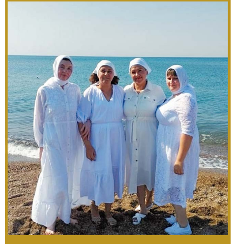
In Western Asia, these new believers traveled to the Mediterranean Sea to be baptized. Praise God for saving souls!