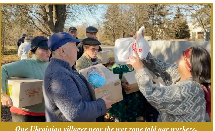
One Ukrainian villager near the war zone told our workers, "Other people flee from here, but you come to help. Thank you!"