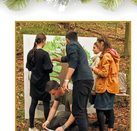
Recalling the exact sequence of David's life can be a challenge.