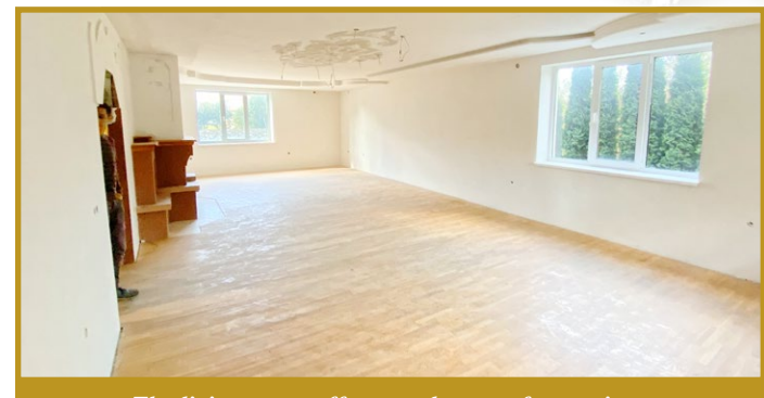
The living room offers ample room for services.