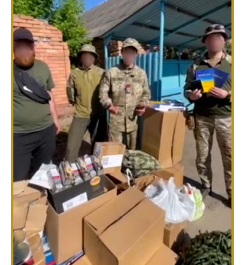
These Ukrainian soldiers are a few of many who have sent BIEM thanks for New Testaments (blue and gold covers) and foodstuffs.