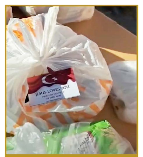
This screen capture comes from a TV broadcast in Turkey warning citizens about missionary activity—gifts of food and clothing, sometimes accompanied by cards saying, "Jesus loves you" in English and Turkish.

In the evening, many people gathered around the bonfires in the streets—Turks, Syrians, Arabs, and Kurds. God gave opportunities to witness of the greatness