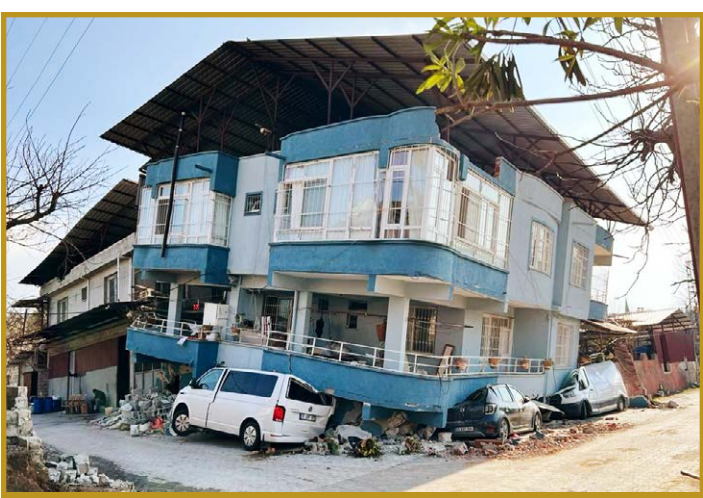
The unexpectedness of the earthquake resulted in damage to countless vehicles that could have been parked in safer areas, if only the owners had known.