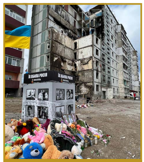
After a Russian missile struck this apartment building in Uman, Ukraine, funds from BIEM provided plastic sheeting to replace glass windows that had been blown out of neighboring apartments. An informal memorial honors the adults and children who perished that night.