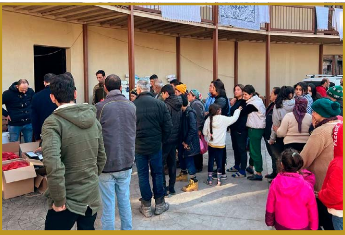
The collapse of houses, apartments, and stores created instant needs.