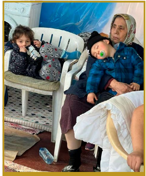
With life turned upside down, some people simply didn't know what to do.