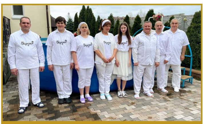
Also in Bilogorodka, these five believers were baptized in April. Their shirts declare, "I believe."