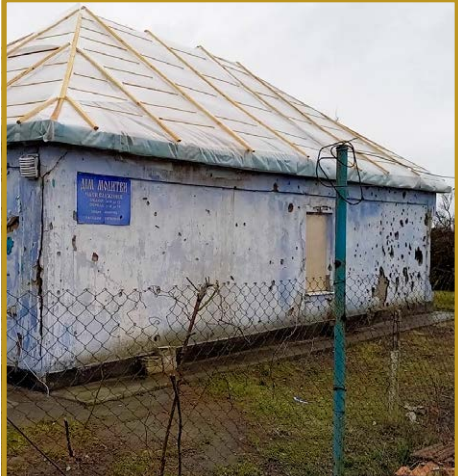
This village church near Kherson took quite a beating from hostilities. Funds from BIEM provided temporary plastic sheeting to keep the rain out.