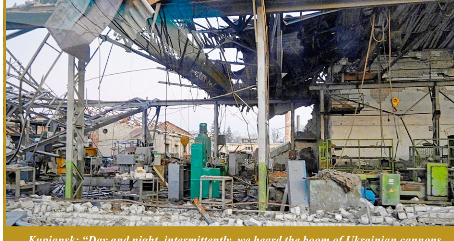
Kupiansk: "Day and night, intermittently, we heard the boom of Ukrainian cannons lofting artillery shells over us and toward the Russians. We also heard the crash of explosions from Russian artillery that had fired over us from the other direction.

We spent most of Friday morning at a church where potatoes were doled out to people. That afternoon my group took two of those vans loaded with food, candles,