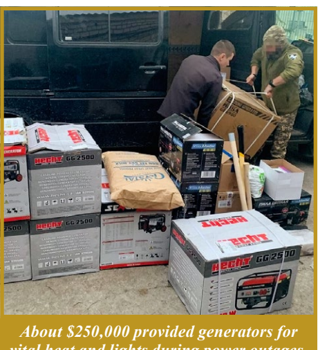
vital heat and lights during power outages.

"When I heard the message of these Tajiks, something in my heart broke, and my eyes filled with tears. I went to the brothers and prayed, accepting Jesus into my heart as my Savior, my Lord, and Someone who gives rest to my weary soul. I came home that night and shared with my poor wife, who faithfully went with me through these hardships. She knelt down that cold night saying, 'Except for you, I have no one. What you believe, I believe. Where you go, I go!' So, she accepted Jesus as her Savior and Lord. We have one son and two daughters who also enjoy reading Injil, and now we support one another. For almost one month now we have given our lives to the Lord, who loves our soul and gives us rest!"