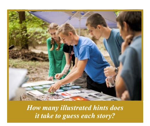
...Bible Quest continued from page 2

Each team had to locate seven checkpoints shown on their maps. At each point, they had to perform a specific task based on the book of Luke.