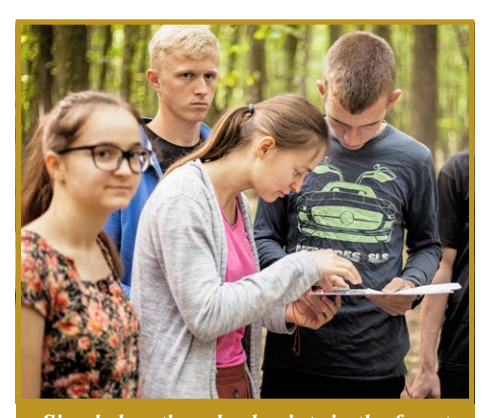
Simply locating checkpoints in the forest required maps and a reliable compass.