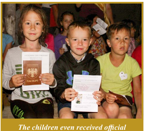
The children even received official passports with their names and photos, verifying Roman citizenship!

Whoever would've guessed that games and competitions in Rome could be so fun?