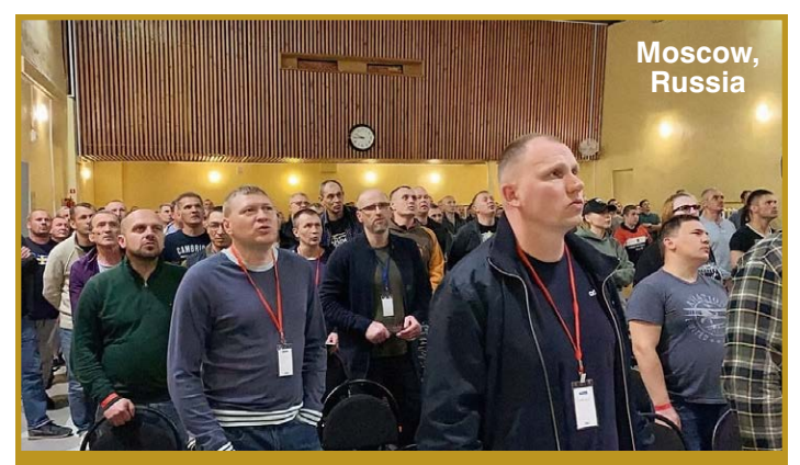
Near Moscow, this year's conference for men who had completed the drug & alcohol rehabilitation program emphasized the theme "Be Strong and of a Good Courage!" (Joshua 1:7) God has used the rehab centers to work mightily in lives.