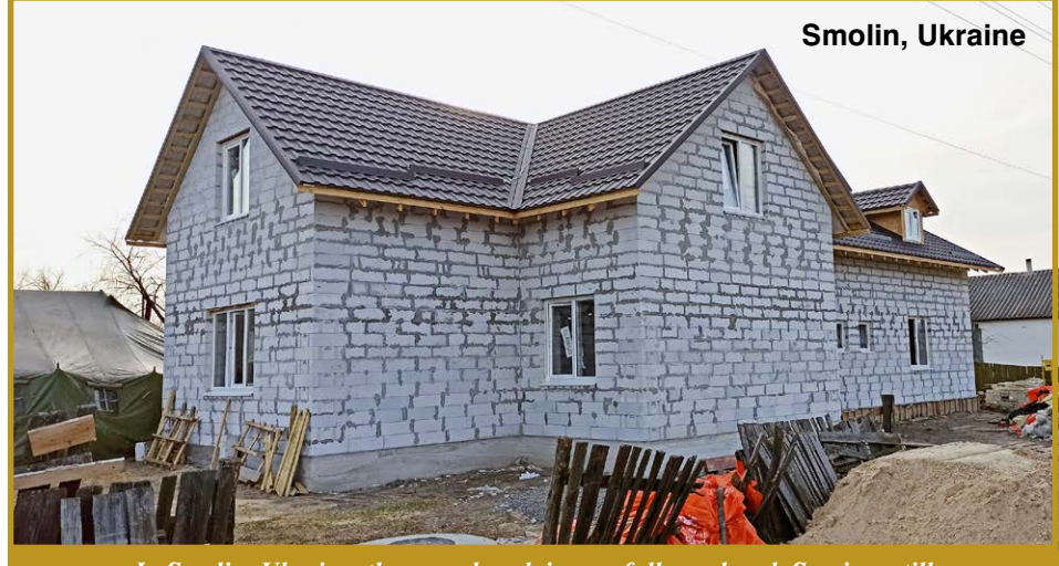
In Smolin, Ukraine, the new church is now fully enclosed. Services still take place in the army surplus tent as construction continues.