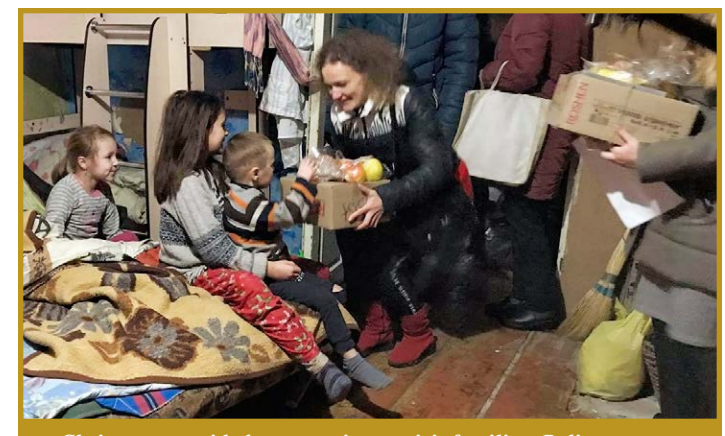
Christmas provided an occasion to visit families. Believers sang carols and delivered gift boxes of food, sweets, and Bibles.

"Also, we did a special evangelistic project. We purchased various items to assemble packages of foods, sweets, and vitamins. Then we set out to visit underprivileged families living in Smolin and Zhevedy in order to give them these gifts continued on page 2