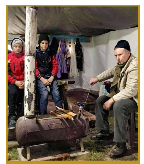
This homemade woodburning device provides heat for tent services.

"We are praying and planning to do a similar project for Easter. That will give us another chance to share about Christ and to demonstrate the love of God.