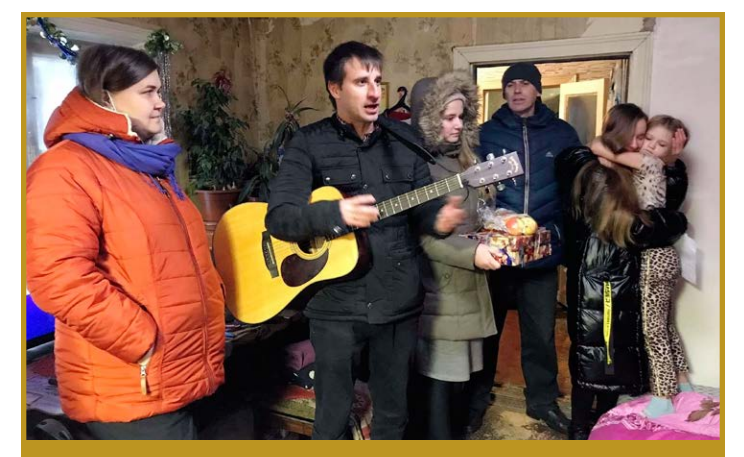
Of course, a brief summary of Christ's birth accompanies each visit.