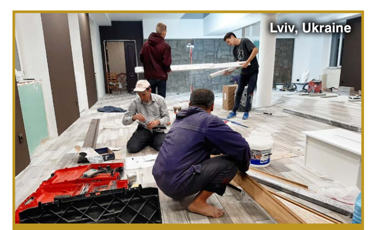
In Lviv, Ukraine, the church continues reconstruction, which will result in a building that is warmer, more attractive, and much more suitable for public services.