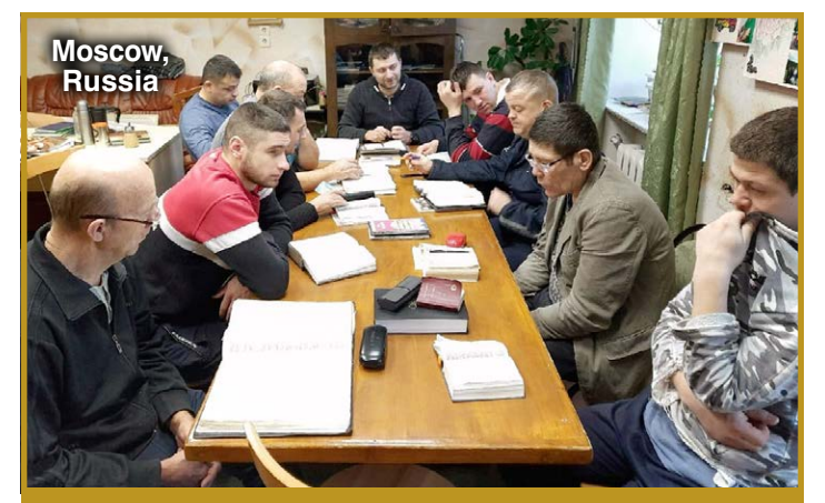
In the Moscow area, "Liberation" Christian rehabilitation center continues guiding alcoholics and drug addicts to new life in Christ. Daily Bible studies are the core of the program.