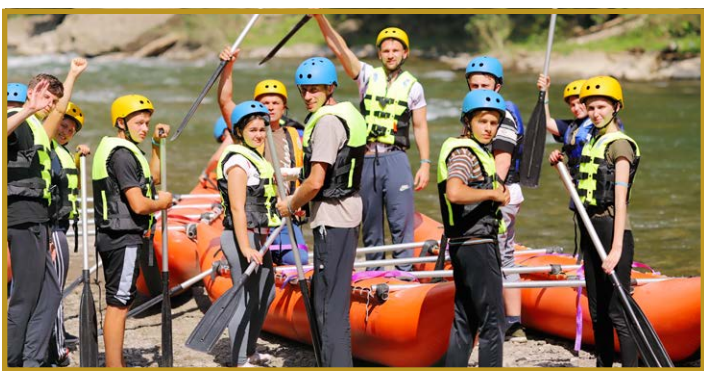
White-water rafting in the Carpathian Mountains may have encouraged fervent prayers!