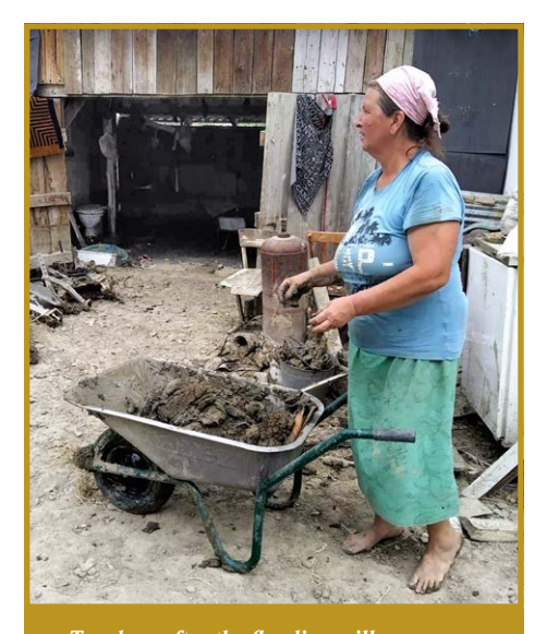
Ten days after the flooding, villagers were still digging belongings from the mud.