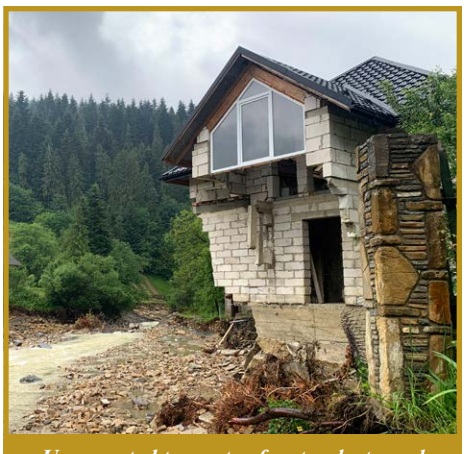
Unexpected torrents of water destroyed or buried whatever lay in their path.