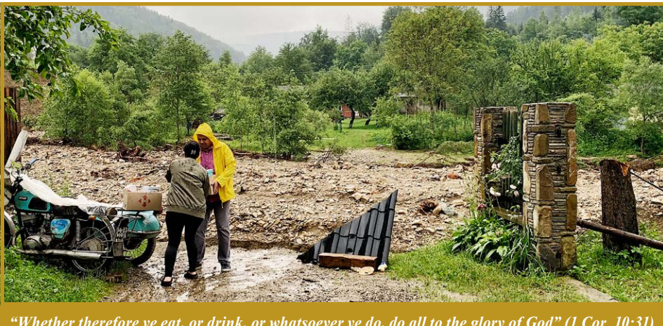
"Whether therefore ye eat, or drink, or whatsoever ye do, do all to the glory of God" (1 Cor. 10:31)

"Please pray that the Lord will continue to work in the people we helped."