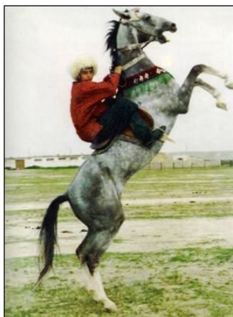
... a real Turkmen, but neither River nor Eagle