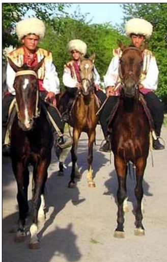
Turkmen in their native dress

TURKMENISTAN -- We very recently sent out an emergency appeal for you to pray for our Turkmen brothers and sisters. "River", "Hope", "Eagle" and other precious friends have come under a very serious threat of death. The ruling elders (Muslim) of their village have decided that these believers are dangerous and must be stopped. They have told the people that they must harass and even kill the pastors and other believers. Of course, the danger believers are facing is heightened if they are found witnessing in their villages and the surrounding communities.