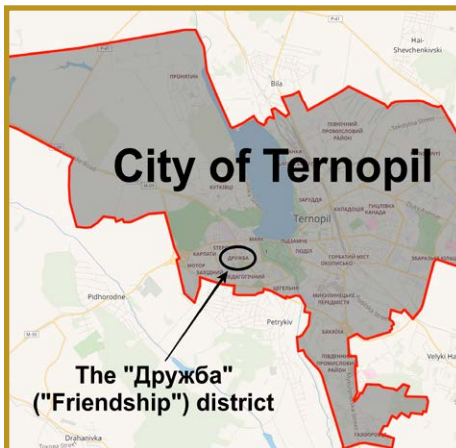
The Druzhba district has become home to thousands of refugees who fled Ukraine’s battle zones.

Choose Life Baptist Church in the Druzhba (“Friendship”) district of Ternopil, Ukraine, is off to an excellent start. Here’s the couple who are focusing their faith and family on reaching Druzhba for Christ!