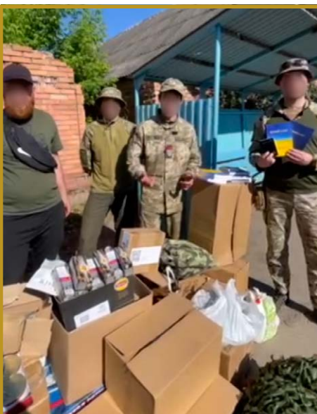
These Ukrainian soldiers are a few of many who have sent BIEM thanks for New Testaments (blue and gold covers) and foodstuffs.