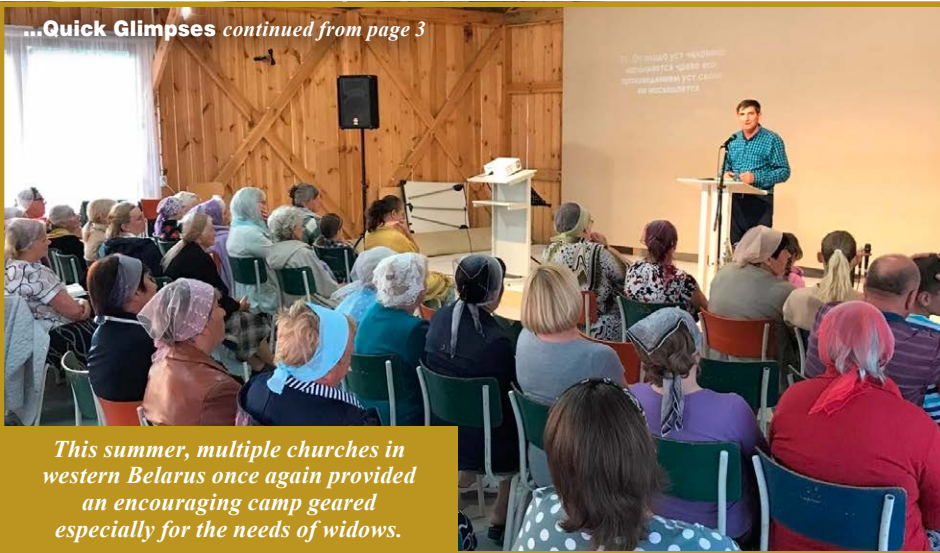
This summer, multiple churches in western Belarus once again provided an encouraging camp geared especially for the needs of widows.