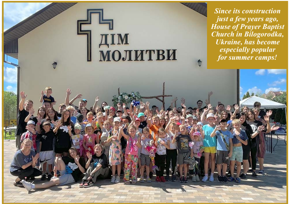
Since its construction just a few years ago, House of Prayer Baptist Church in Bilogorodka, Ukraine, has become especially popular for summer camps!