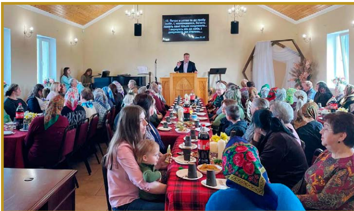
In Bilogorodka, Ukraine, a special Saturday service ministered to local widows, some of whom lost husbands, sons, or fathers in the war.