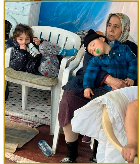
With life turned upside down, some people simply didn't know what to do.