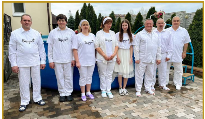
Also in Bilogorodka, these five believers were baptized in April. Their shirts declare, "I believe."