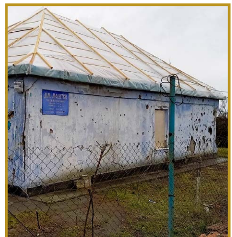
This village church near Kherson took quite a beating from hostilities. Funds from BIEM provided temporary plastic sheeting to keep the rain out.