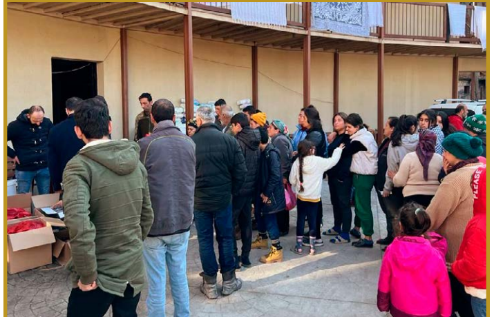
The collapse of houses, apartments, and stores created instant needs.