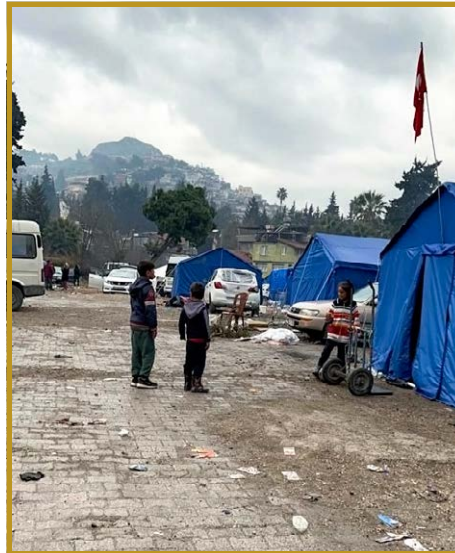
Emergency tents provide temporary shelter for many who lost homes.