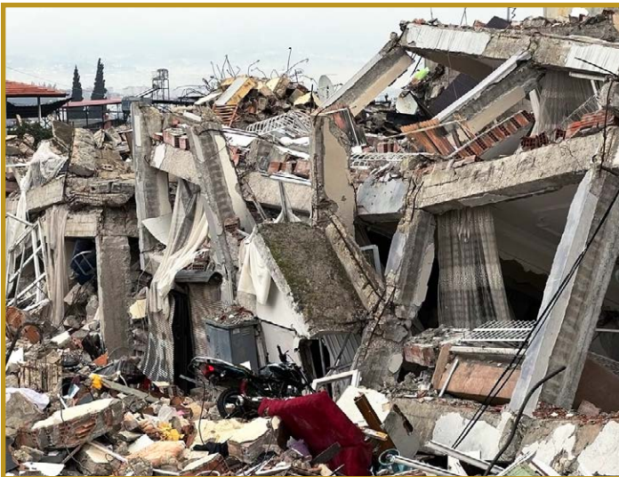
Turkey's February 6 earthquake made some places look like a war zone.

“ T he first thing we did was to declare a time of prayer with Christian Turks. Then we began