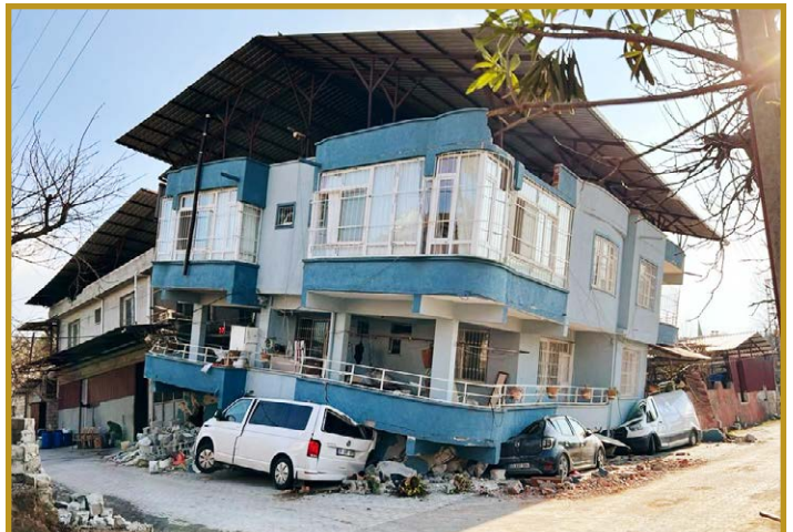
The unexpectedness of the earthquake resulted in damage to countless vehicles that could have been parked in safer areas, if only the owners had known.

Christians from both inside and outside Turkey responded with prayer and action.