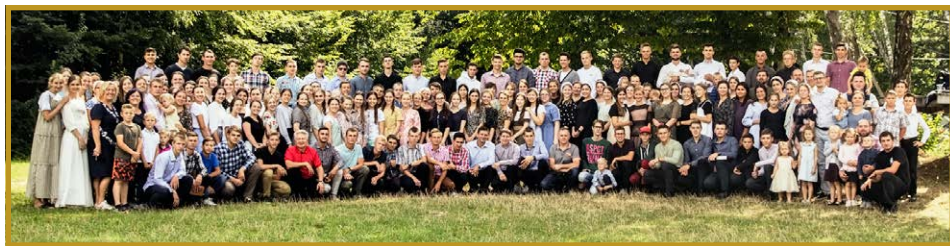
About 200 young people from all over Ukraine participated in this year's Bible Quest.

On Saturday, August 21, about 200 young people and their youth leaders arrived at the property rented for this event. That evening they held their first youth service, which focused on "The