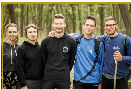
Applying knowledge of God's Word to solve problems builds wholesome camaraderie.