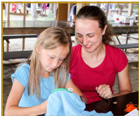
Camps give adult leaders opportunities to form one-on-one friendships.

...Camping in Rome continued from page 3 shined just as if nothing had happened. Both children and adults praised Him for that supplemental lesson.