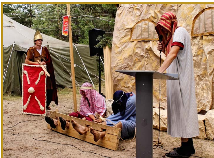
Actors brought Bible stories to life. This Philippian jailer “thrust Paul and Silas into the inner prison and made their feet fast in the stocks” (Acts 16:24).