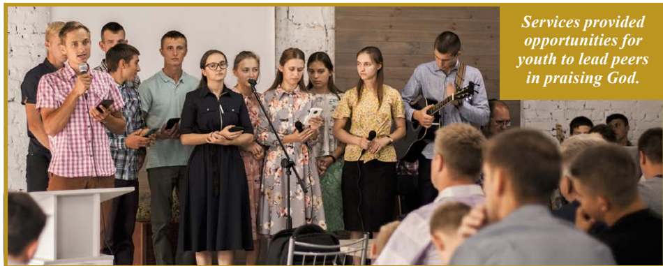
Services provided opportunities for youth to lead peers in praising God.

Purpose of Life." The evening concluded with a time of fellowship.