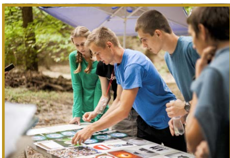
How many illustrated hints does it take to guess each story?