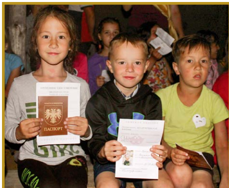
The children even received official passports with their names and photos, verifying Roman citizenship!