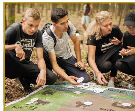
Matching events to their locations strictly from memory can be tricky.