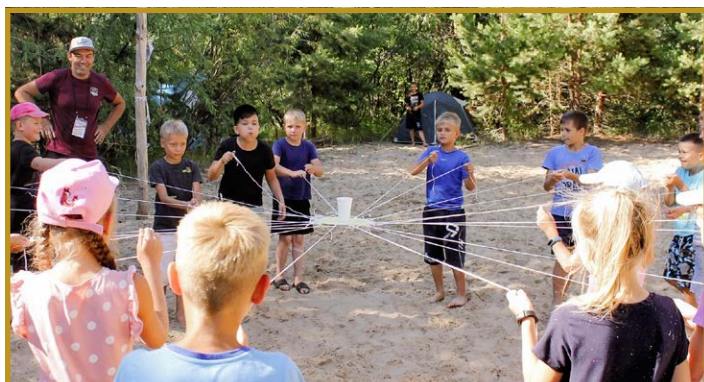
Working as a team requires good communication—and sometimes steady hands.