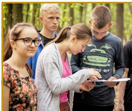
Simply locating checkpoints in the forest required maps and a reliable compass.