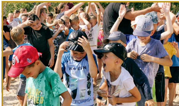
Whoever would've guessed that games and competitions in Rome could be so fun?

provided by the photos, such a camp required a tremendous amount of planning and coordination. Specific teams included the organizers, the youth mentors, the cooks, and of course the brethren who set up tents and performed the actual building. Many