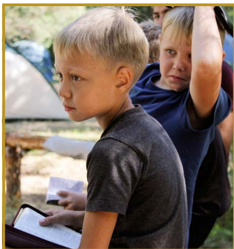
Tomorrow’s Christian leaders—your gifts are contributing to their formation!

To see a 5-minute video of clips from this Roman camp, go to: https://vimeo.com/591614583 . At the conclusion of each summer, BIEM prepares a Summer Camp Report, which is a longer, more detailed account of how God used the camps. Donors to summer camps automatically receive a copy in autumn. Others may also receive one by requesting it.