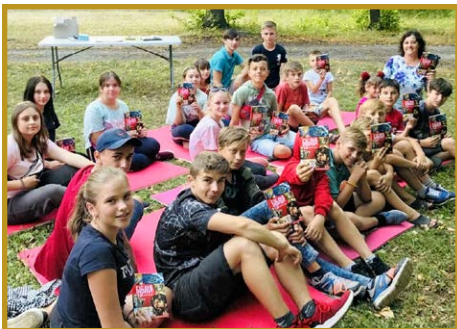
In Glibochok, Ukraine, local authorities at first banned gatherings. But then they reversed that decision, enabling a blessed teen camp!

Meanwhile, here are some quick glimpses. Thank you so much for supporting the camp ministry! ■