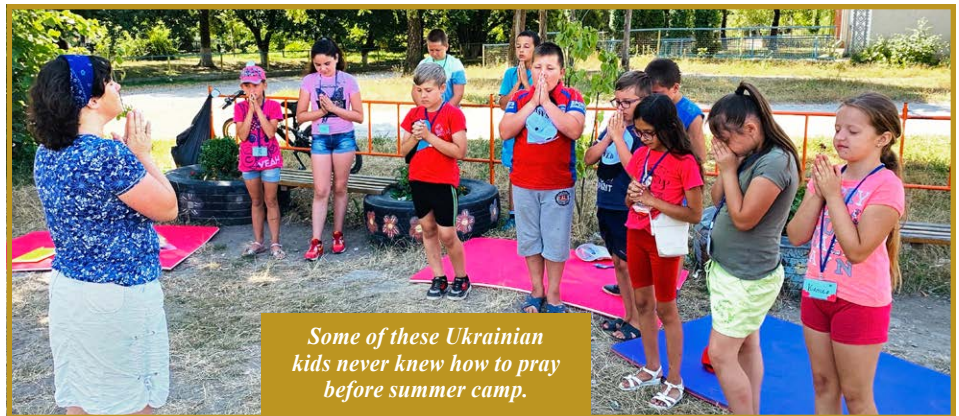
Some of these Ukrainian kids never knew how to pray before summer camp.