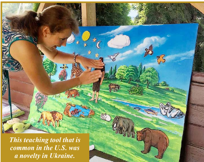
This teaching tool that is common in the U.S. was a novelty in Ukraine.

If you would like to help sponsor the purchase of Betty Lukens flannelgraphs, they are needed and are a tremendous blessing for children's Bible lessons. See the list of Year-End Projects for details. ■