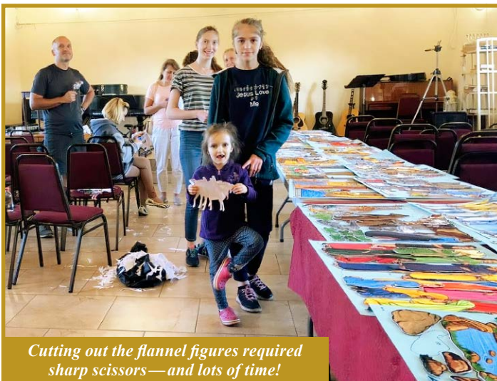
Cutting out the flannel figures required sharp scissors—and lots of time!