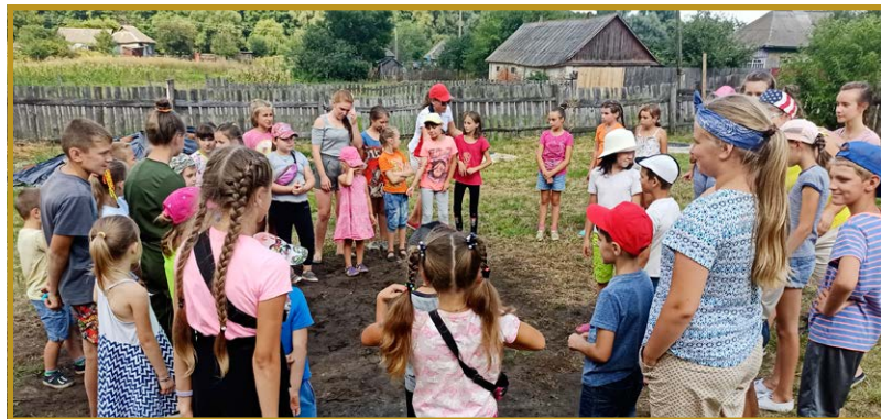
Children in the village of Smolin, Ukraine, rejoiced when they heard believers would once again hold a Christian camp for them.