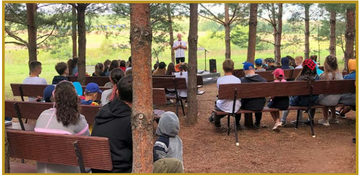
In Central Russia, as elsewhere, there's something powerful about teaching God's Word away from kids' normal environment.