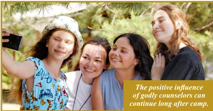
The positive influence of godly counselors can continue long after camp.