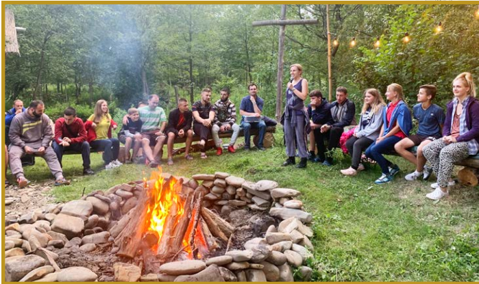
In Extreme Youth Camp in western Ukraine, half the campers came as unsaved. That week, various ones gave testimony of placing faith in Christ!