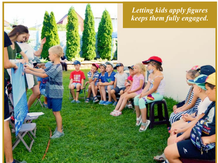
Letting kids apply figures keeps them fully engaged.