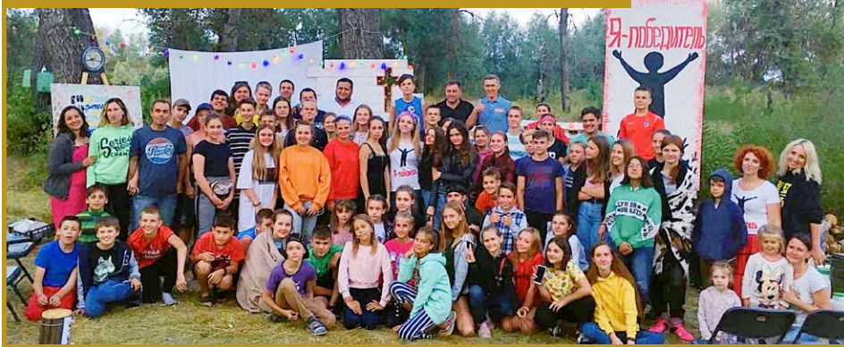
After tent camp in Desna, Ukraine, parents thanked leaders for holding such a wholesome event. So did city administrators!