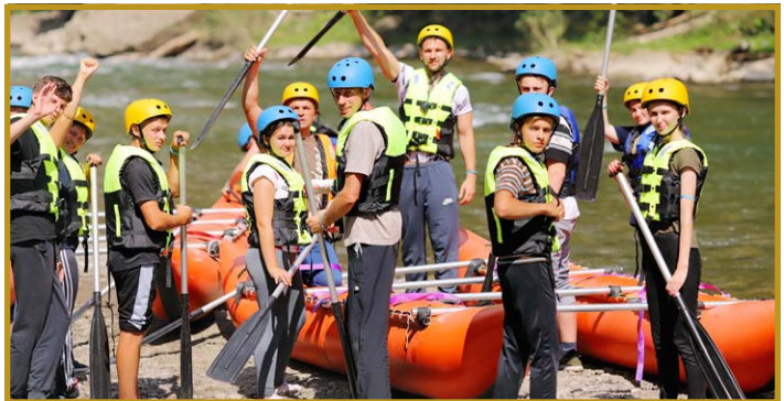
White-water rafting in the Carpathian Mountains may have encouraged fervent prayers!