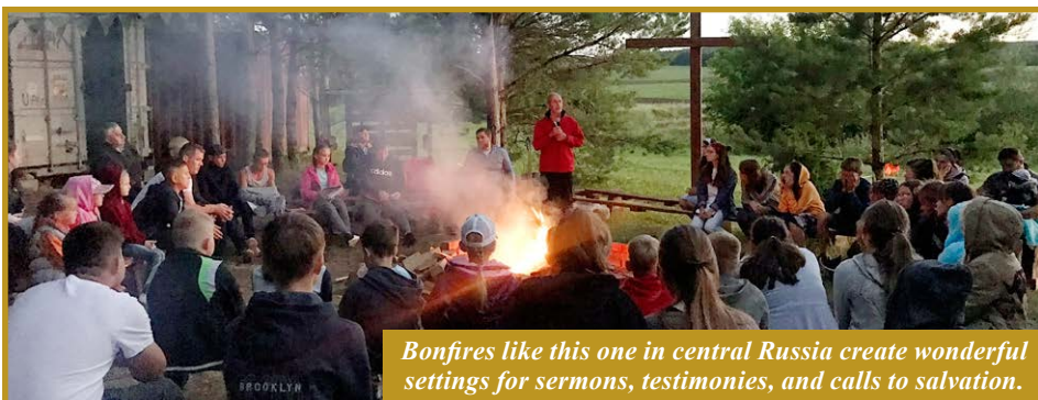
Bonfires like this one in central Russia create wonderful settings for sermons, testimonies, and calls to salvation.