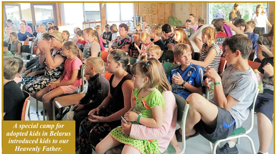
A special camp for adopted kids in Belarus introduced kids to our Heavenly Father.