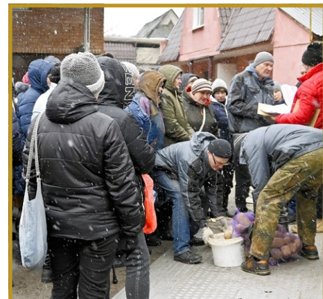
Doling out potatoes: "The number of potatoes given to each person was relative to how many people are in their household."

"In addition to food, we took a partial truckload of OSB wood sheets and corrugated asbestos-cement roofing panels. These provided for roofing repairs for churches and homes."