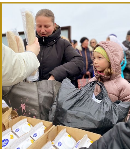
Here, church members in Smolin distribute basic foodstuffs to local villagers. In such circumstances, what must unbelievers like this young girl think about believers?

As of mid-February, BIEM has distributed one million dollars in war relief!