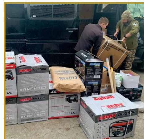
About $250,000 provided generators for vital heat and lights during power outages.

“When I heard the message of these Tajiks, something in my heart broke, and my eyes filled with tears. I went to the brothers and prayed, accepting Jesus into my heart as my Savior, my Lord, and Someone who gives rest to my weary soul. I came home that night and shared with my poor wife, who faithfully went with me through these hardships. She knelt down that cold night saying, ‘Except for you, I have no one. What you believe, I believe. Where you go, I go!’ So, she accepted Jesus as her Savior and Lord. We have one son and two daughters who also enjoy reading Injil , and now we support one another. For almost one month now we have given our lives to the Lord, who loves our soul and gives us rest!” ■