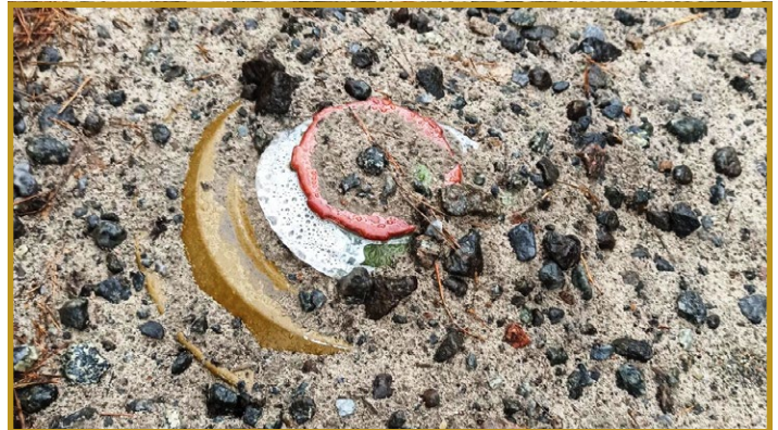
Occasionally, the elements reveal lethal mines, but not always.

...Thanks a Million continued from page 1 as needs arose. Some of these churches sustained damage from artillery or bombs, and in such cases our aid assisted them in making repairs.