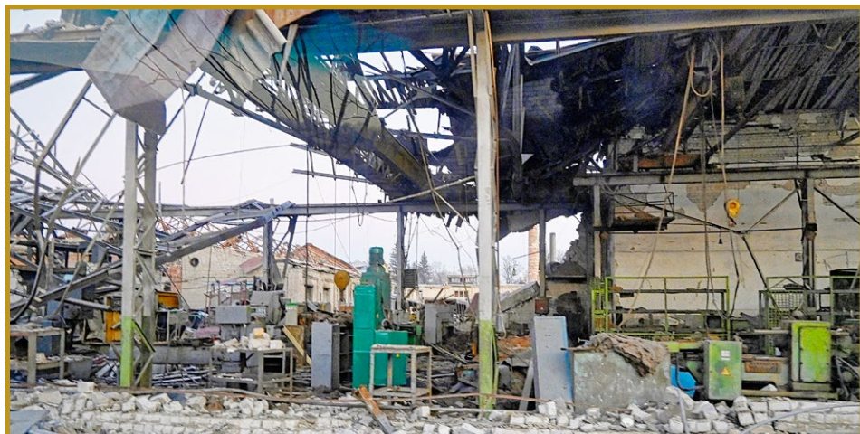
Kupiansk: "Day and night, intermittently, we heard the boom of Ukrainian cannons lofting artillery shells over us and toward the Russians. We also heard the crash of explosions from Russian artillery that had fired over us from the other direction."

We spent most of Friday morning at a church where potatoes were doled out to people. That afternoon my group took two of those vans loaded with food, candles,