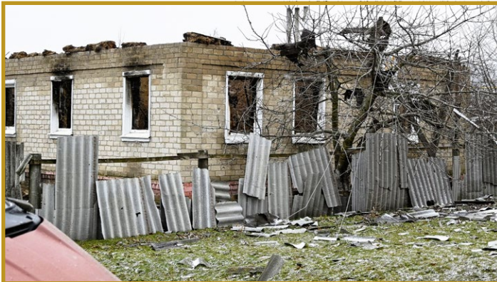
"Sometimes walls remained, but the roofs had caved in."

Please don't shut your heart of compassion for these people who remain in great distress! Please continue to pray fervently. If you can help in material ways, please do. ■