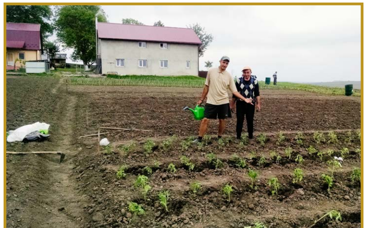
In addition to Bible studies and personal counseling, the Rehab Center’s program includes physical labor and active involvement growing food for the center.