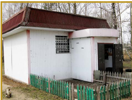
The village store isn't large. But some villages in Ukraine have no store at all.

One day I dropped by the village store (it's quite small), where a husband and wife were shopping. Both were drunk, and they were talking loudly to the woman behind the counter. The husband was expressing his frustration that their village of Andreevka has no store, forcing them to drive ten kilometers [about six miles] to our village for groceries.