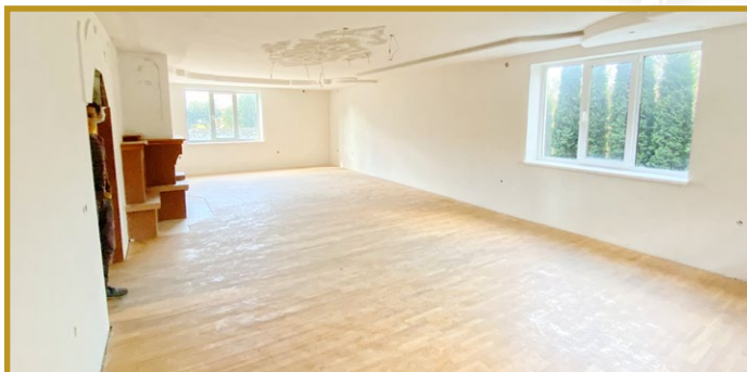
The living room offers ample room for services.