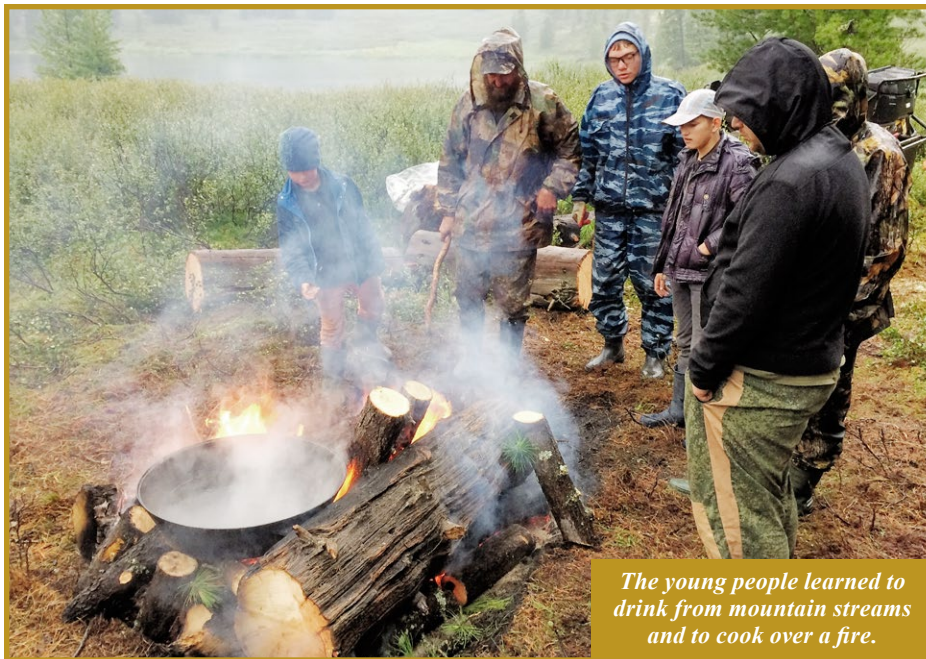
The young people learned to drink from mountain streams and to cook over a fire.