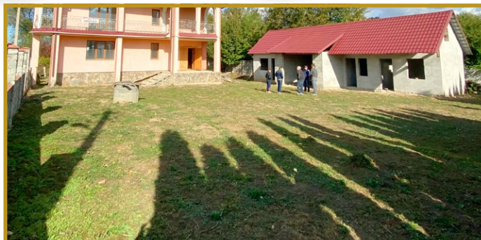
The yard offers plenty of space for children's activities.