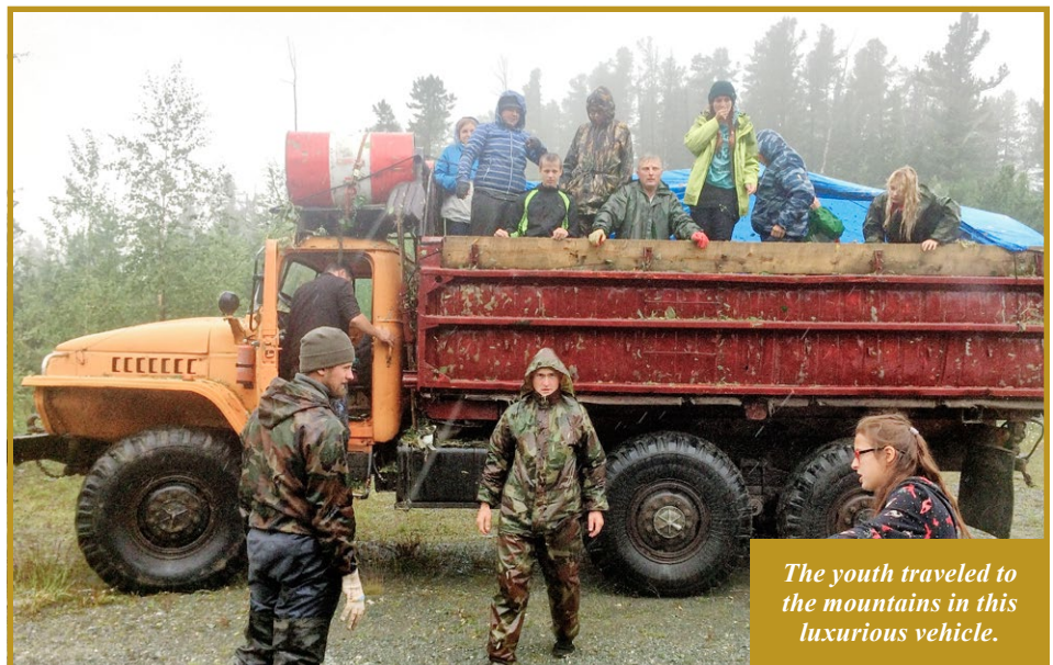
The youth traveled to the mountains in this luxurious vehicle.