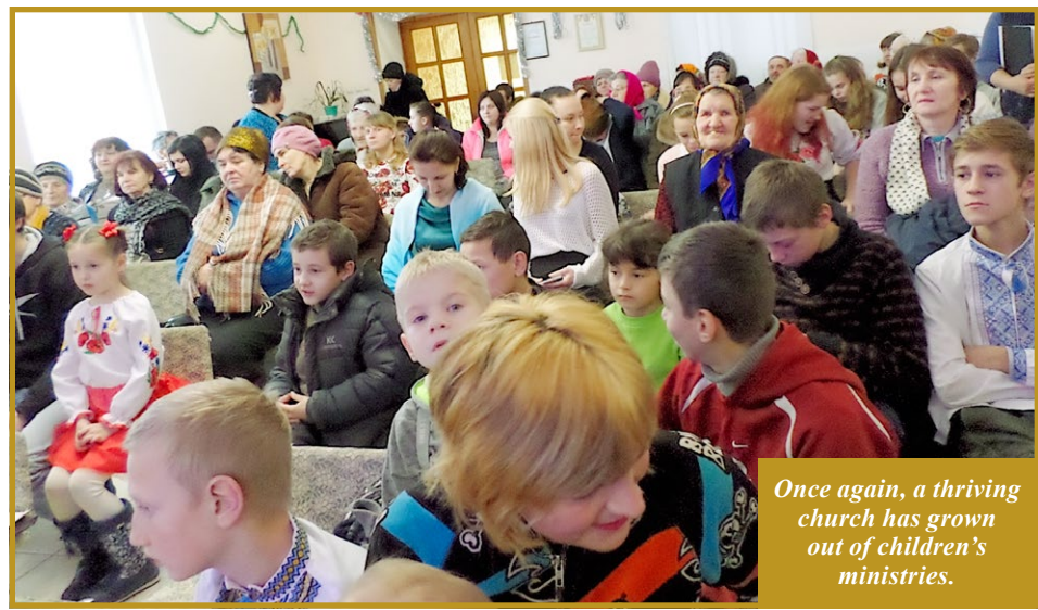
Once again, a thriving church has grown out of children's ministries.

Our church was founded thanks to evangelistic outreaches for children that we held in our village of Lipovka in the Mikarovsky