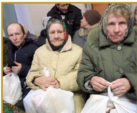
Gifts of groceries to widows and the bedridden gave a strong testimony of Christian love to the community.

Dear friends of BIEM, never doubt that your prayers and your gifts make a difference, both on earth and for eternity. If you would like to send a gift for Widows, Orphans and Needy Children, churches like this one will apply those gifts locally.