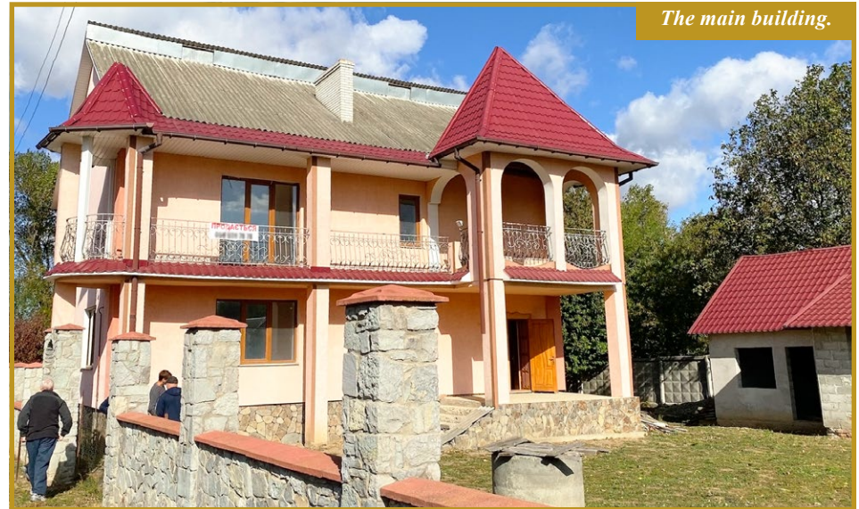
The main building.

...Lipovka continued from page 2 spiritual enrichment of the community, particularly of the children.