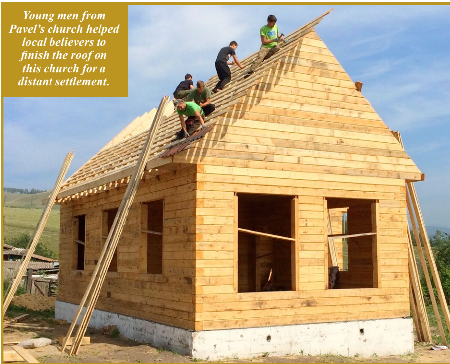
Young men from Pavel's church helped local believers to finish the roof on this church for a distant settlement.

121 Commerce Drive, Suite 50 Danville, IN 46122