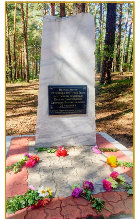
A memorial of Soviet times: "In this place on October 29, 1937, were shot 22 Evangelical Christian-Baptist ministers."