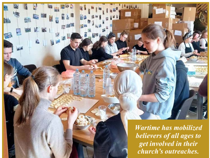
Wartime has mobilized believers of all ages to get involved in their church's outreaches.