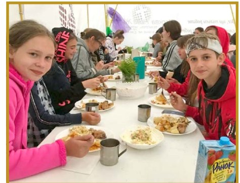
In BIEM-sponsored camps, young people are well fed, both physically and spiritually.

In the past, our annual goal for camps has been $40,000. However, prices have increased dramatically due to the war and shortages. This year we hope to raise $50,000. Of that, we already have $21,400 on hand, leaving $28,600 still needed. Can you help us to hold camps for kids and youth, not only in Ukraine but also in other countries of Eastern Europe? If so, please designate your gift "Summer Camps." ■