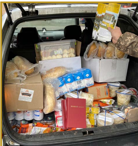
Believers don’t simply deliver physical food. They also deliver New Testaments and Christian tracts—spiritual food!