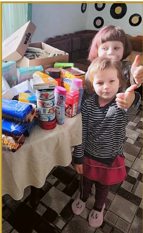
Praise God, BIEM is providing foodstuffs that many families haven't seen for quite a while.