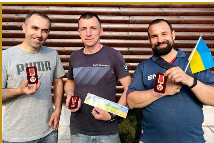
These brothers expect Heavenly rewards for Christian service, but the Ukrainian army honored them, too!

https://vimeo.com/717531414 – "Blessings from the War?" ■