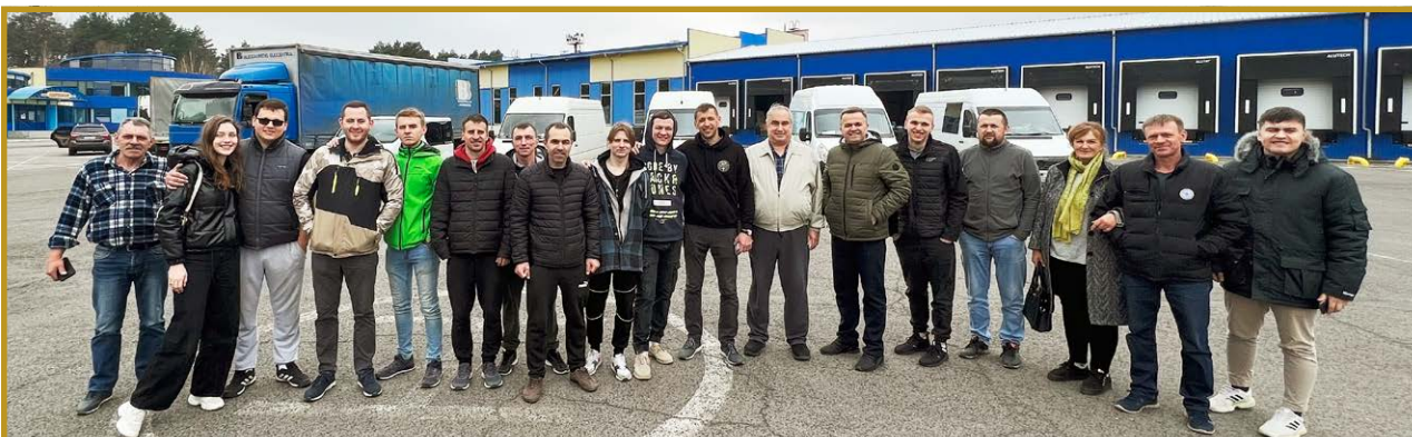
Here's a sampling of the full-sized trucks, vans, and volunteers we use to transport our aid across Ukraine and to local distribution points.