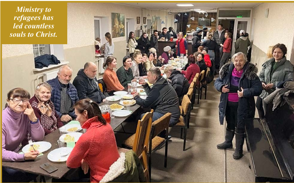
Ministry to refugees has led countless souls to Christ.