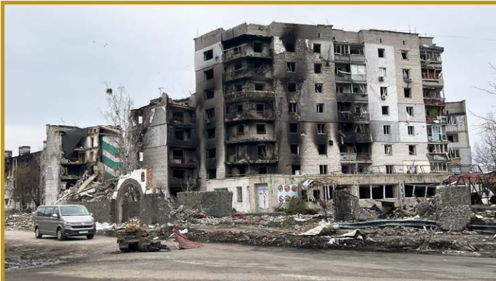
Refugees carry few possessions because their homes were destroyed or they fled with no time to pack.