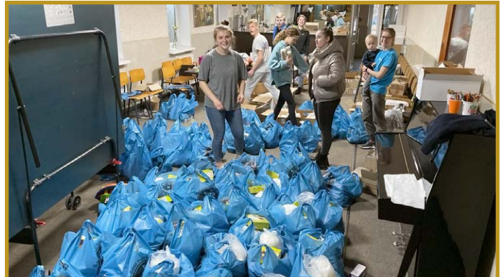
These young people volunteered to organize aid into plastic sacks for delivery to needy ones.