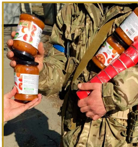
By providing food for soldiers and praying with them, Ukrainian believers have opened a new door for evangelism.