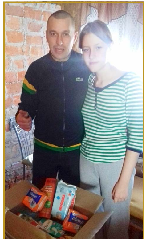
When stores have been destroyed or emptied, even basic supplies mean a lot.