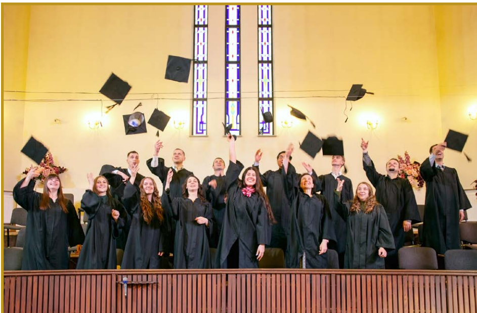
Tossing their caps into the air was more than just gladness at graduating. It was also these graduates' expression of joy for God's blessing.