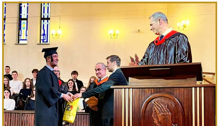
Students from multiple nations have studied at KTS. This graduate is from Iran and expressed his gratitude for the valuable theological training.