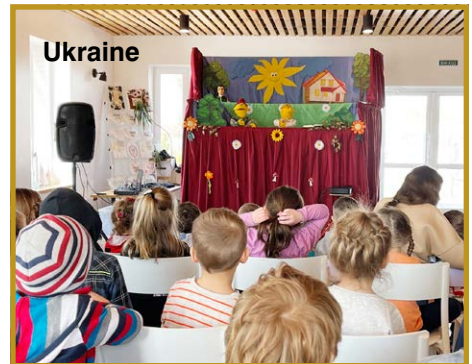
For over a year, Covid prevented ministries like this puppet show, which has taken the Gospel to all sorts of locations. Now, praise God, such ministries are now resuming.