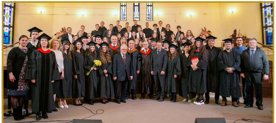
Kyiv Theological Seminary continues to prepare believers for ministry.